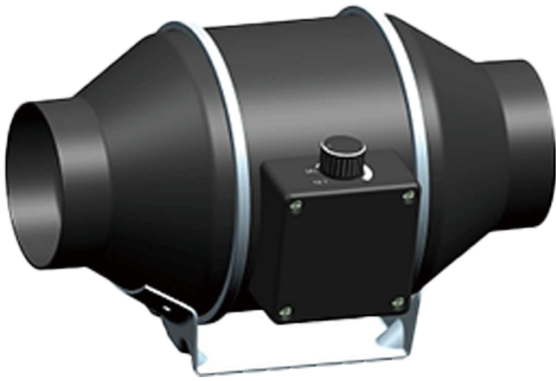
Control Panel Type